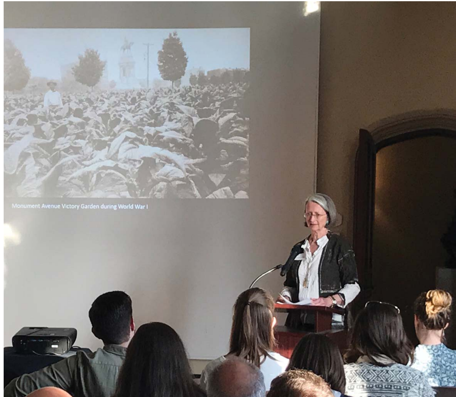
Monument Avenue Victory Garden during World War I