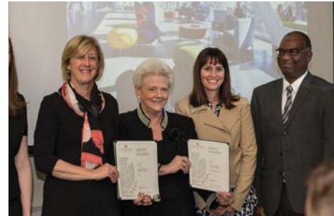
Chapter Citation: Preservation Virginia