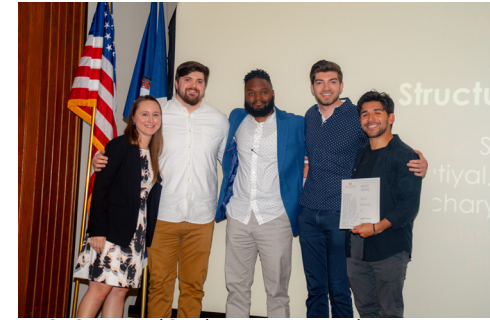
HKS - Structured Symbiosis Merit Award