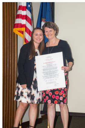
Jeanne Lefever Marcellus Wright, Jr. Award