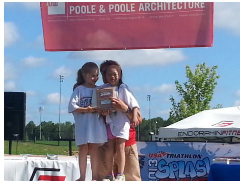
2PA gives back

Poole & Poole Architecture is a Platinum Annual Sponsor of AIA Richmond.