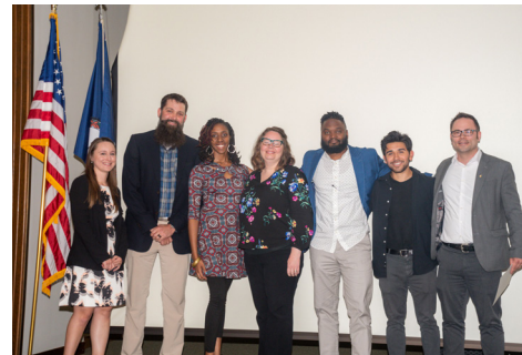
HKS - Reimagining Benefield Merit Award