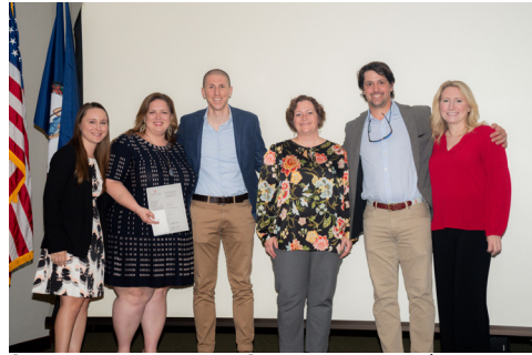
SMBW - 1717 Innovation Center Honor Award

Thank you to Gresham Smith and Lighting Virginia for being event sponsors!