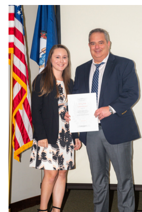
Warren Davies Craftsmanship Award