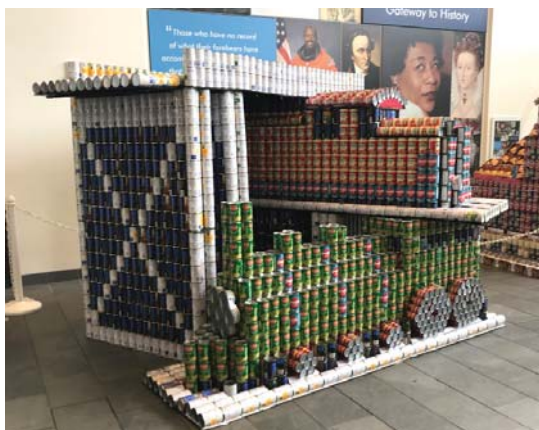
Quinn Evans with DMWPV - The Triple Crossing