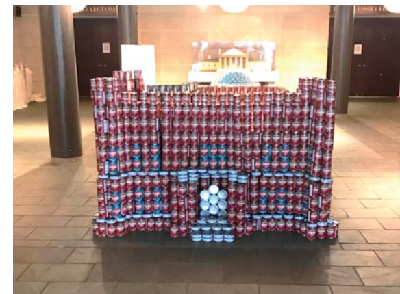
Baskervill - The Black History Museum