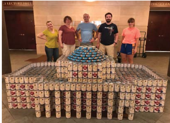
Commonwealth Architects - Science Museum of Virginia

Virginia Foundation for Architecture, Virginia Museum of History & Culture, Rockfon, Custom View Windows & Doors, Eagle Commercial Construction, Kingspan, Sierra Pacific Windows, Gresham Smith, Skyline Brick, Panera Bread, Einstein Bros Bagels, ZZQ, Roots Natural Kitchen, Keith Fabry, Party Perfect and Triple Crossing