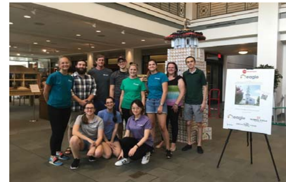
Eagle Commercial Construction - St. John's Church