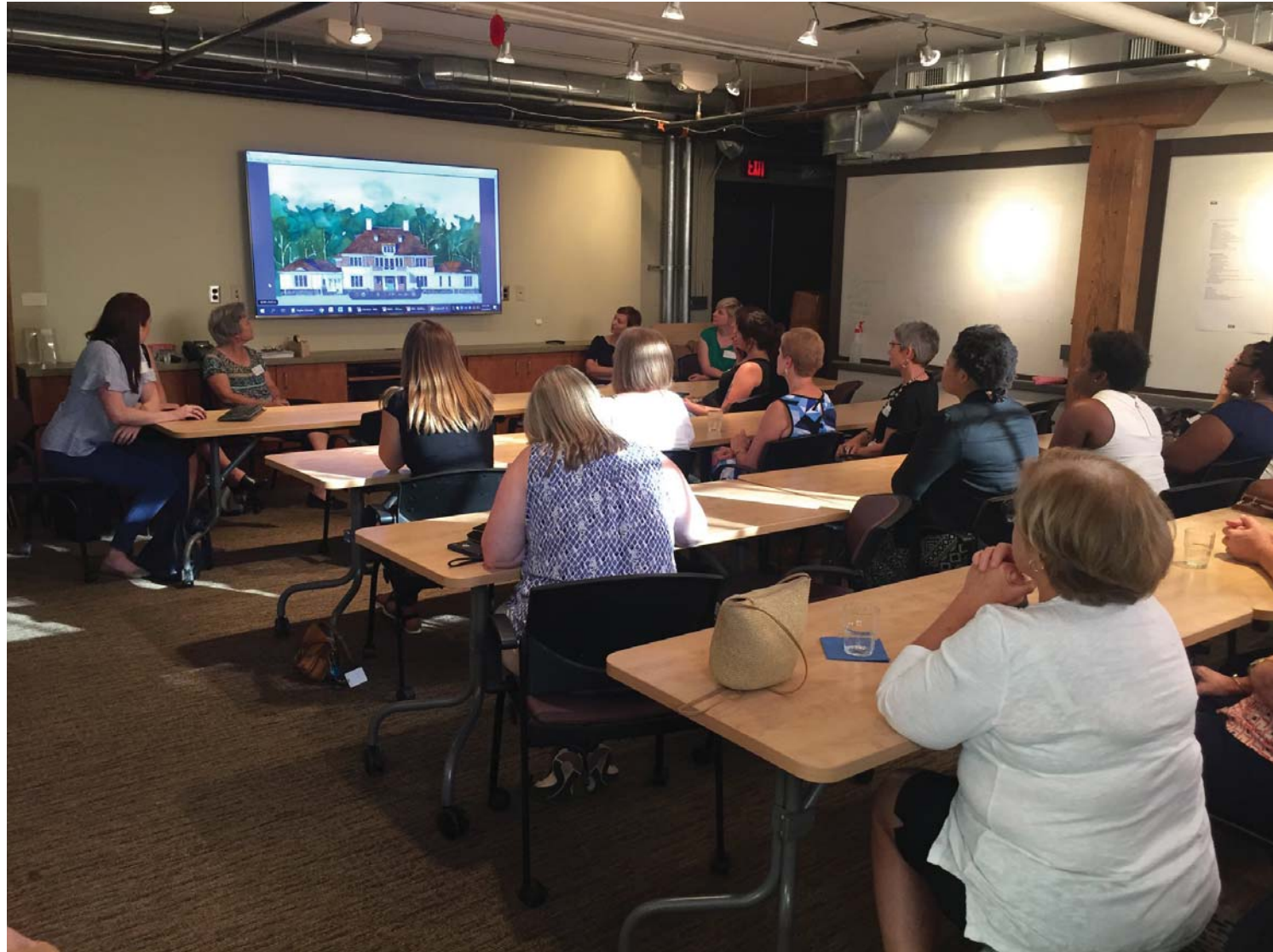
The Panel Discussion at Glavé & Holmes Architecture