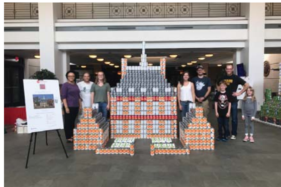
Glavé & Holmes - The Governor's Palace