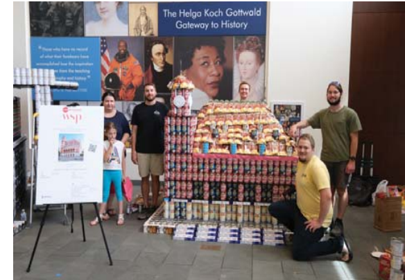
WSP - Main Street Station