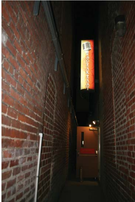
Alley Entrance in Speakeasy style...

The chapter hosted its annual Holiday party on December 4th, in the heart of Jackson Ward, at the Hippodrome's Speakeasy Grill.