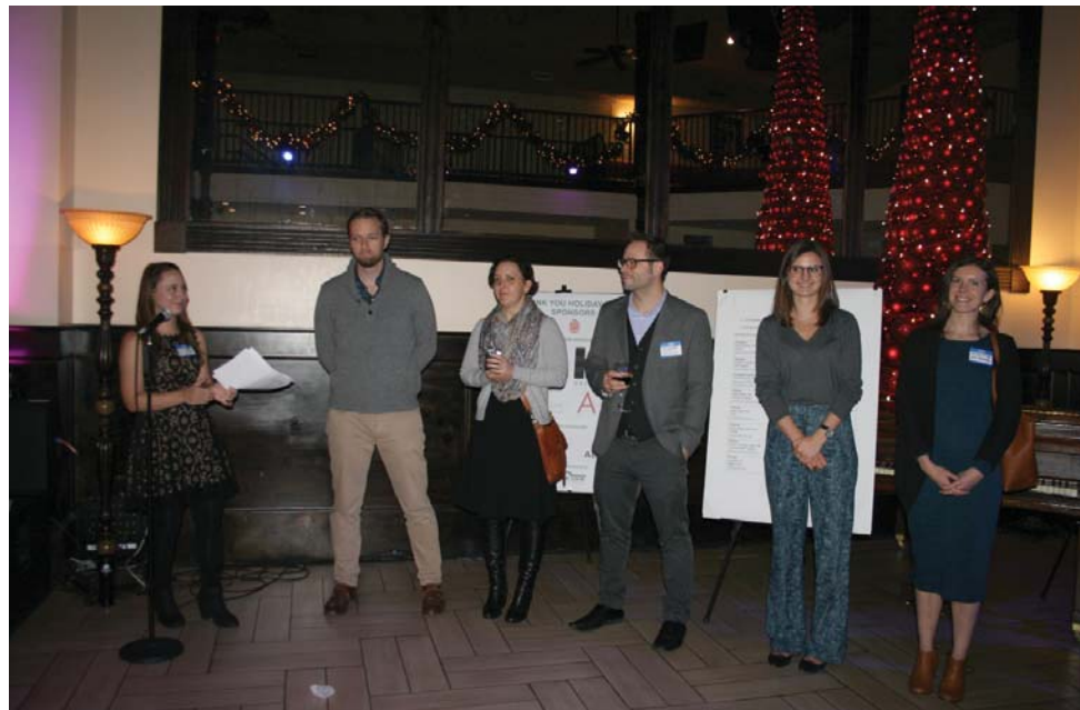
Meet the New Board Members!