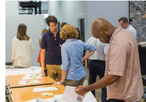
Attendees had an opportunity to review some of the progress to date as well as to contribute their own vision for the city.