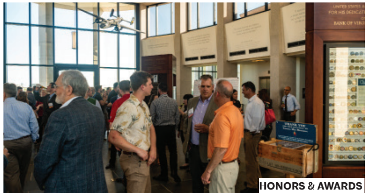
HONORS & AWARDS